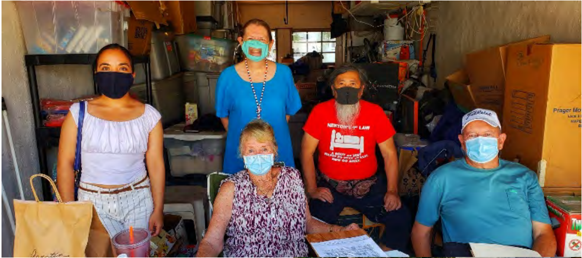
BSF Board Members making it work for our students in this time of social distancing.